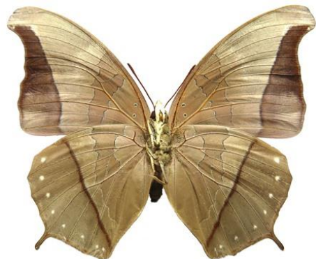
Laodice porthos porthos. Female. Left – upperside; right – underside. Biakatu, Kivu, DRC. September 2010. ABRI. ex ABRI Collection (ABRI 2018-5260).