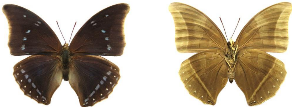
Laodice zelica zelica . Female. Left – upperside; right – underside.