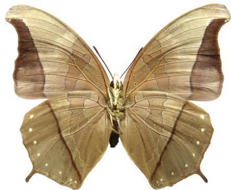
Laodice porthos porthos. Female. Left – upperside; right – underside. Biakatu, Kivu, DRC. September 2010. ABRI. ex ABRI Collection (ABRI 2018-5260).