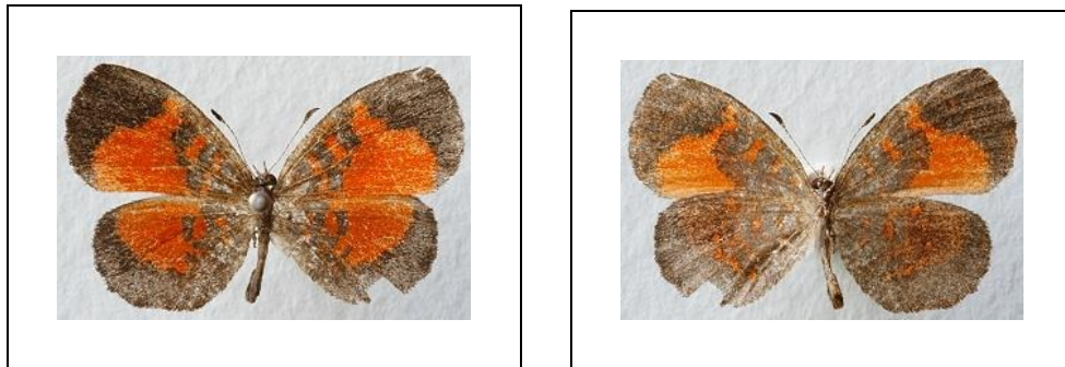
Eresiomera magnimacula . Female. Left – upperside; right – underside. Radio Hill, Mabira Forest, Uganda. 14 June, 2009. J. & C. Dobson.

Type locality: [Democratic Republic of Congo]: “Urwalde, bei Beni”.