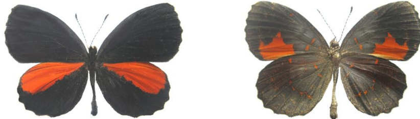
Eresiomera bicolor . Male. Left – upperside; right – underside. Bobiri Forest, Ghana. 23 May 2014. Images M.C.Williams ex Gardiner Collection.

Pseuderesia bicolor Grose-Smith & Kirby, [1890]. In Grose-Smith & Kirby, [1887-92]. Rhopalocera exotica, being illustrations of new, rare and unfigured species of butterflies 1: 44 (183 pp.). London. Eresiomera bicolor Grose-Smith & Kirby, 1890. d'Abreu, 2009: 634.