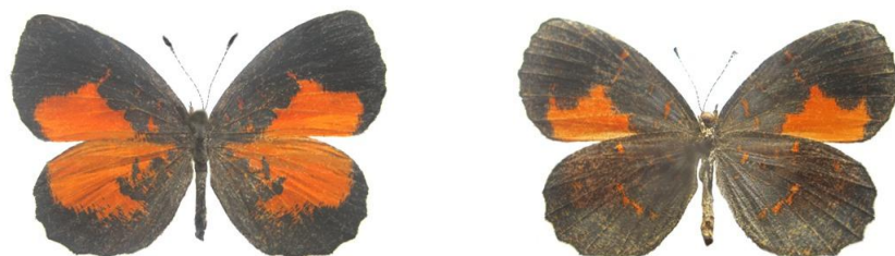
Eresiomera bicolor. Female. Left – upperside; right – underside. Bobiri Forest, Ghana. 24 May 2014.