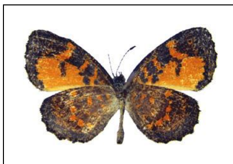
Eresiomera petersi . Male, Ivory Coast.

Left – upperside; right – underside.