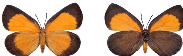
Tumerepedes flava . Female. Left – upperside; right – underside. Ivory Coast.

Type locality: Nigeria: “Upper Niger [near Katsina (Larsen, 2005a)]”.