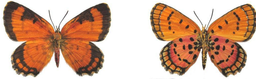
Erikssonia cooksoni . Female. Left – upperside; right – underside. Mundwiji Plain, Mwinilunga dist., Zambia. 21 September 2003.

Type locality: [Democratic Republic of Congo], not Zambia ( see Cookson, 1954): “North-west Rhodesia”.