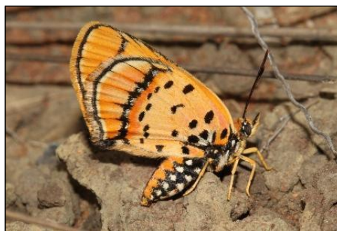
Male (left) and female (right) of the Waterberg Copper, Erikssonia edgei . Bateleur Nature Reserve, Limpopo Province, South Africa. 3 March 2013.

Erikssonia acraeina (Trimen, 1891). Pringle et al. , 1994: 227. [misidentification] Erikssonia edgei Gardiner & Terblanche, 2010. African Entomology 18 (1): 183 (171-191).