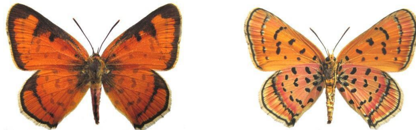
Erikssonia acraeina. Female. Left – upperside; right – underside. Kataba (16 04 09S; 25 05 19E), Western Province, Zambia. 18 January 2004.