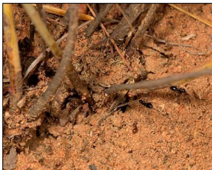
Base of Gnidia microcephala plant with Lepisiota ants.