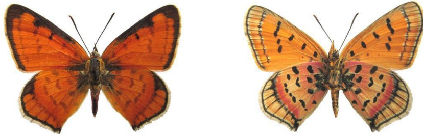
Erikssonia acraeina. Male. Left – upperside; right – underside. Kataba (16 04 09S; 25 05 19E), Western Province, Zambia. 10 April 2004.