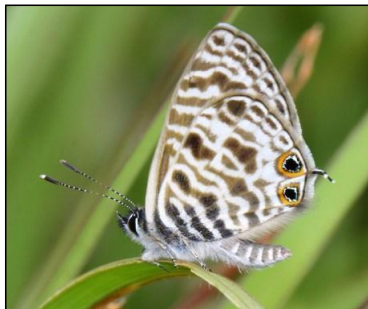
Babault's Zebra Blue ( Leptotes babaulti ) male underside.

Leptotes babaulti Stempffer, 1935. d'Abreu, 2009: 812.