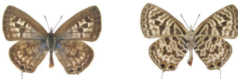
Leptotes pirithous pirithous . Female (Wingspan 26 mm). Left – upperside; right – underside. Cintsa East, Eastern Cape Province, South Africa. 23 December 2001. M. Williams. Images M.C.Williams ex Williams Collection.