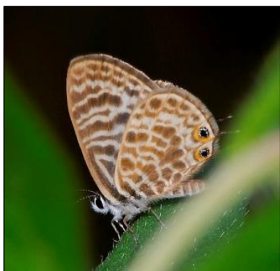
Sesbania Zebra Blue ( Leptotes pulchra ) male underside

Lycaena pulchra Murray, 1874. Transactions of the Entomological Society of London 1874 : 524 (523-529).