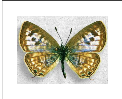
Leptotes brevidentatus. Female upperside.