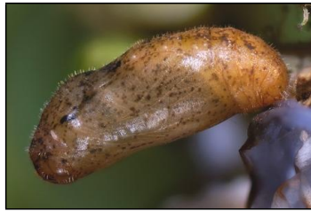
Early stages of Leptotes pirithous . Pupa.