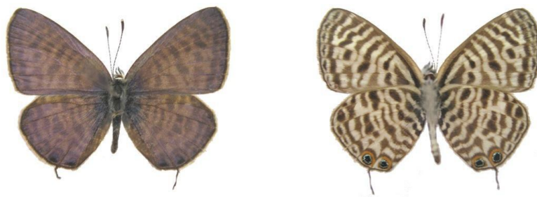
Leptotes pirithous pirithous . Male (Wingspan 25 mm). Left – upperside; right – underside. Limpopo River, Limpopo Province, South Africa. 1 May 2011. M. Williams.

Papilio pirithous Linnaeus, 1767. Systema Naturae 1 (2), 12 th edition: 790 (533-1328 pp.). Holmiae. Lycaena telicanus Herbst. Trimen, 1866a. [Synonym of Leptotes pirithous ] Lycaena telicanus (Lang, 1789). Trimen & Bowker, 1887b. [Synonym of Leptotes pirithous ] Syntarucus telicanus Lang. Swanepoel, 1953a. [Synonym of Leptotes pirithous ] Syntarucus pirithous (Linnaeus, 1767). Dickson & Kroon, 1978. Leptotes pirithous (Linnaeus, 1767). Kielland, 1990d. Leptotes pirithous (Linnaeus, 1767). Pringle et al. , 1994: 237. Leptotes pirithous Linnaeus, 1767. d'Abreu, 2009: 812.