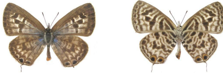
Leptotes pirithous pirithous . Female (Wingspan 26 mm). Left – upperside; right – underside. Cintsa East, Eastern Cape Province, South Africa. 23 December 2001. M. Williams.