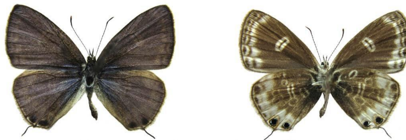
Leptotes sp. Aberrant male. Left – upperside; right – underside. Lekgalameetse N.R., Limpopo Province, South Africa. 6 January 2017. Images M.C. Williams ex J. Greyling Collection.

Alternative common name: Common Blue (Lawrence, 2014).