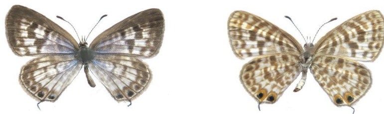
Leptotes pulchra pulchra . Female (Wingspan 26 mm). Left – upperside; right – underside. Tembe, KwaZulu-Natal, South Africa. 19 April 2003. J. Dobson. Images M.C. Williams ex Dobson Collection.

Alternative common name: Beautiful Zebra Blue.