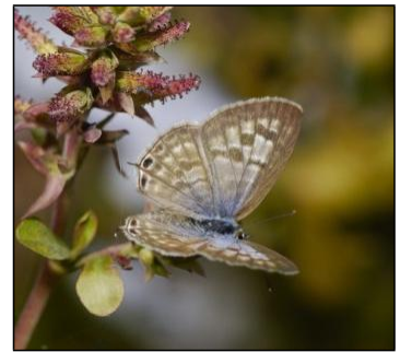
Common Zebra Blue ( Leptotes pirithous ) male upperside (left), male underside (centre) and female upperside (right)

Papilio pirithous Linnaeus, 1767. Systema Naturae 1 (2), 12 th edition: 790 (533-1328 pp.). Holmiae.