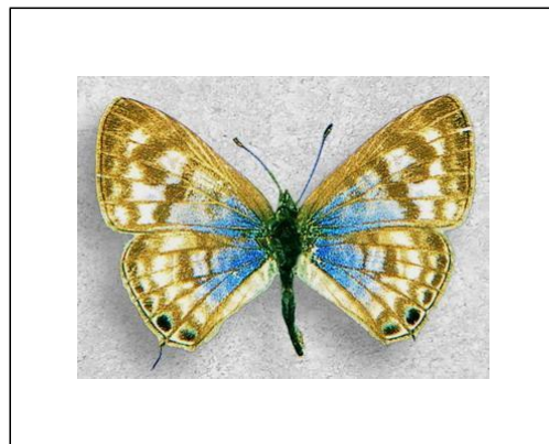
Leptotes jeanneli . Female upperside.

Type locality: Kenya: “mont Elgon versant est, 2.470 mètres”.