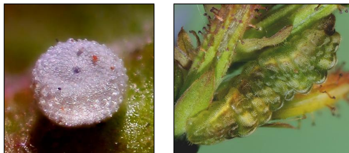
Early stages of Leptotes pirithous . Left – egg. Right – final instar larva.