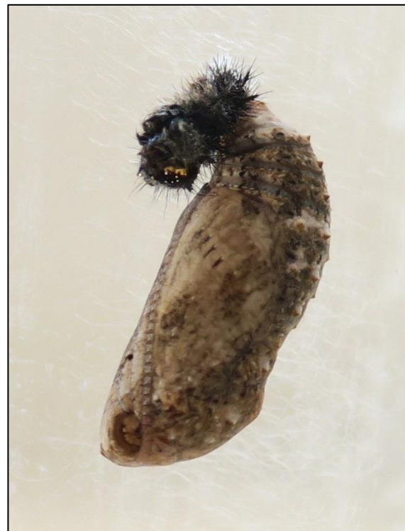
Figure 2 – The Junonia orithya pupa on a glass door.

After five evenings, having eaten only fitfully in captivity, the caterpillar disappeared from its plant pot and made its way to pupate on the pane of a sliding glass door, where BR found it the next morning. It hung there for another day, its hind end fastened to the glass by a silken pad, before sloughing its larval skin to expose a pale grey-brown chrysalis (Fig. 2).