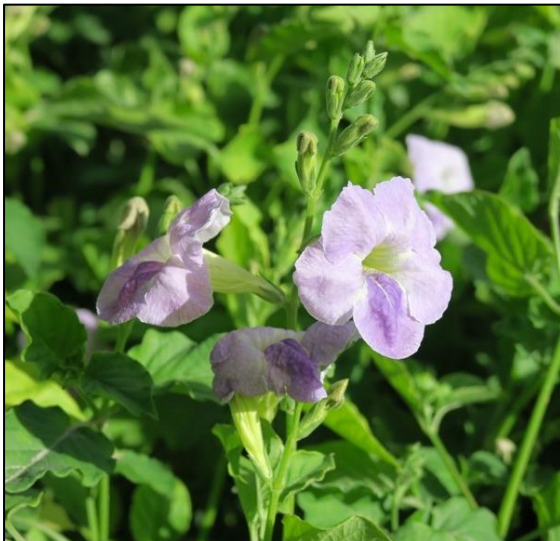
Figure 1 – The ornamental petunia at Mushrif Park, apparently the common garden hybrid Petunia x atkinsiana (also known as P. x hybrida ), on which a spiky black caterpillar of Junonia orithya was found.

In mid-December 2017, in Dubai's Mushrif Park, a long-established property with a mix of natural and landscaped environments, BR noticed a single, spiky black caterpillar of what appeared to be Junonia orithya among the leaves of a thick bed of cultivated petunias, apparently the common garden hybrid Petunia x atkinsiana (Solanaceae), also known as P. x hybrida (Kwei & Esmonde, 1977; Wikipedia) (Fig. 1).